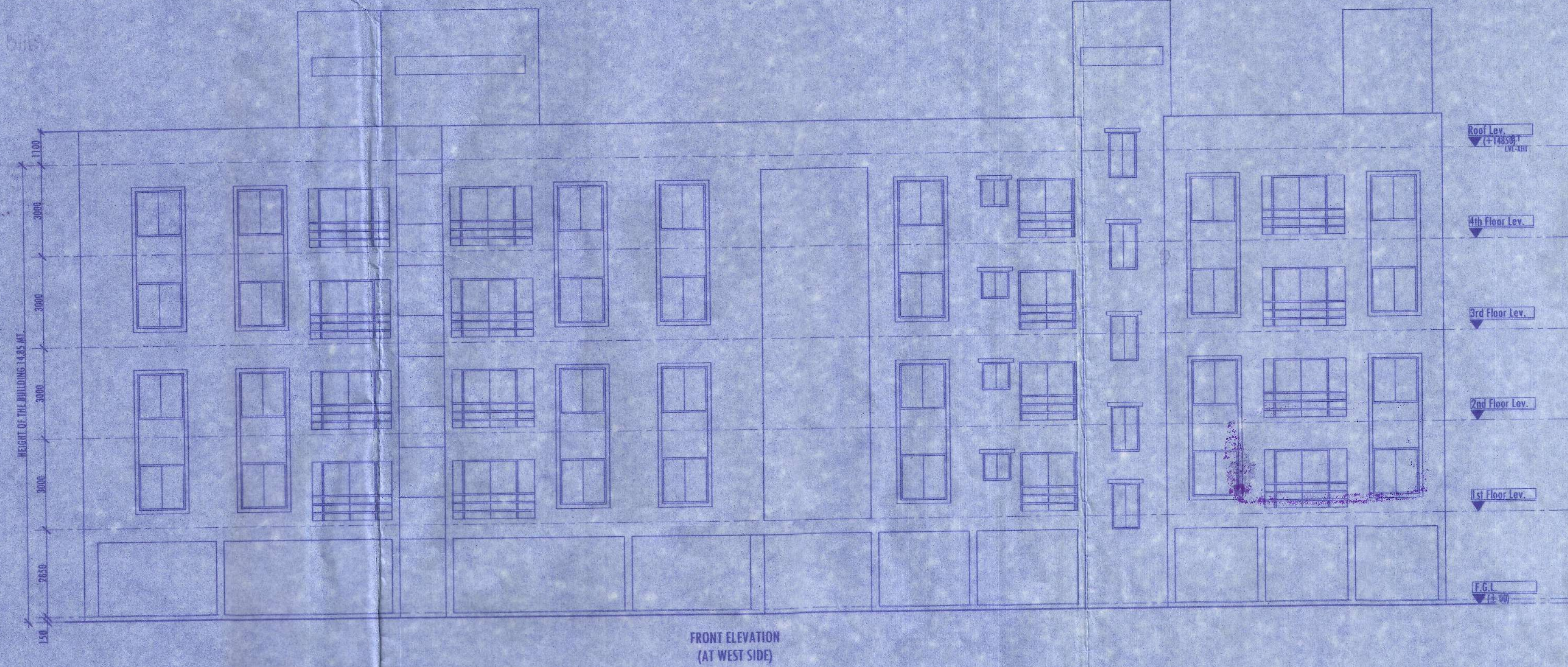
FRONT ELEVATION (AT WEST SIDE)

Assistant Engineer ASSISTANT ENGINEER South 24 Pgs. Z.P. District Engineer District Engineer South 24 Pgs. Z.P. Sanction should be obtained from the concerned Panchayat Saral Assistant Engineer Assistant Engineer South 24 Pgs. Z.P. District Engineer District Engineer South 24 Pgs. Z.P.